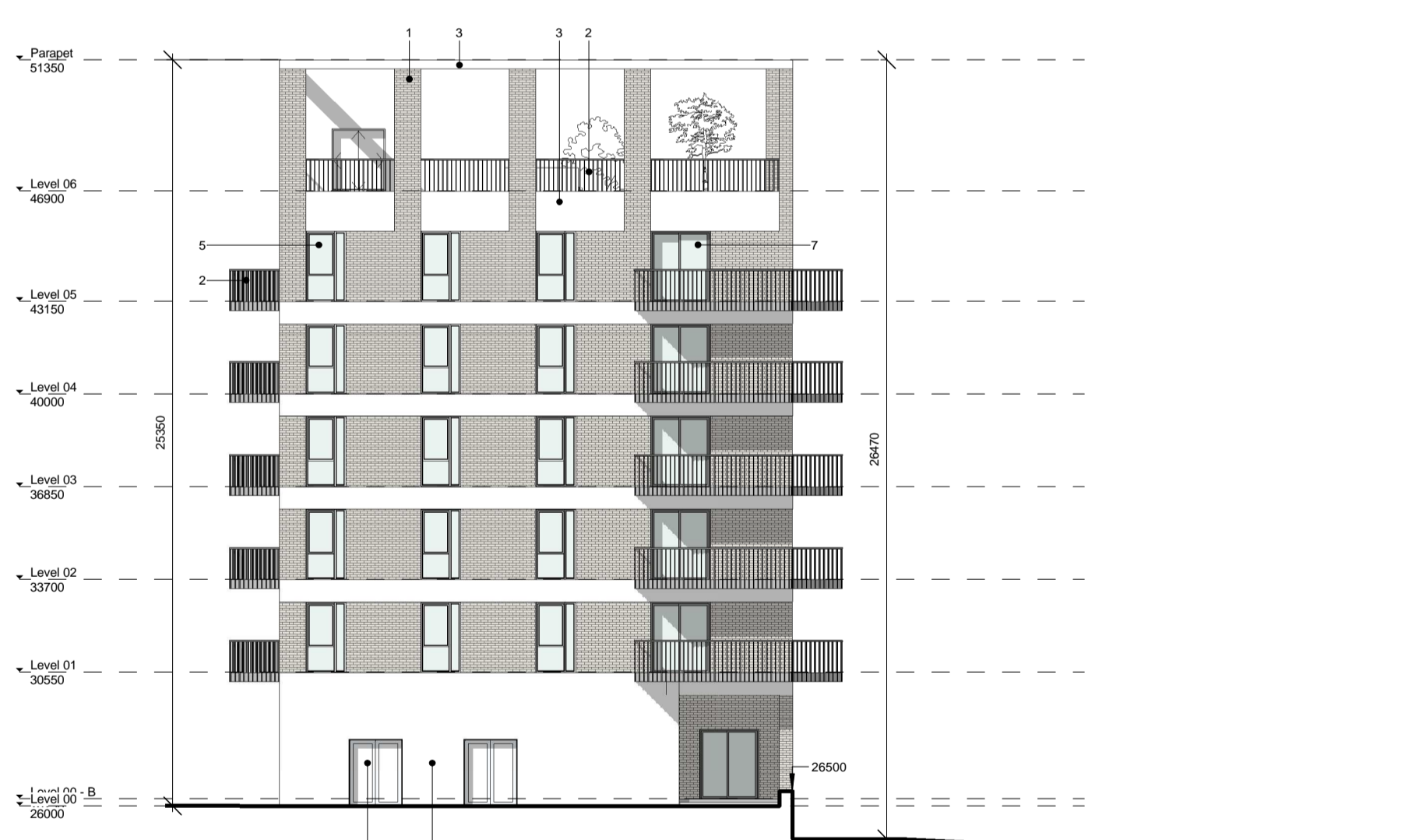
3 Block F - Elevation South 1 : 200