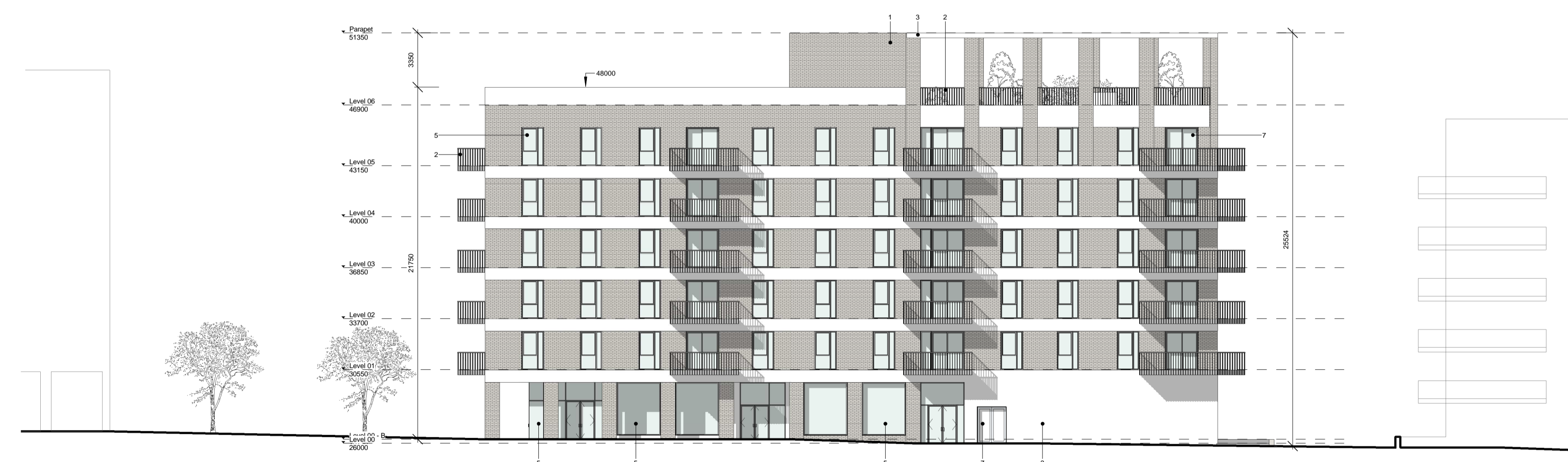
Block B 4 Block F - Elevation West 1 : 200