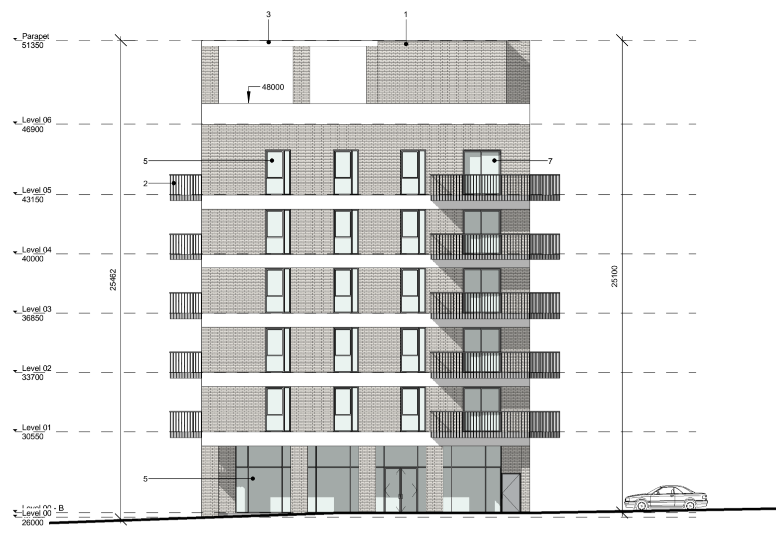
1 Block F - Elevation North 1 : 200