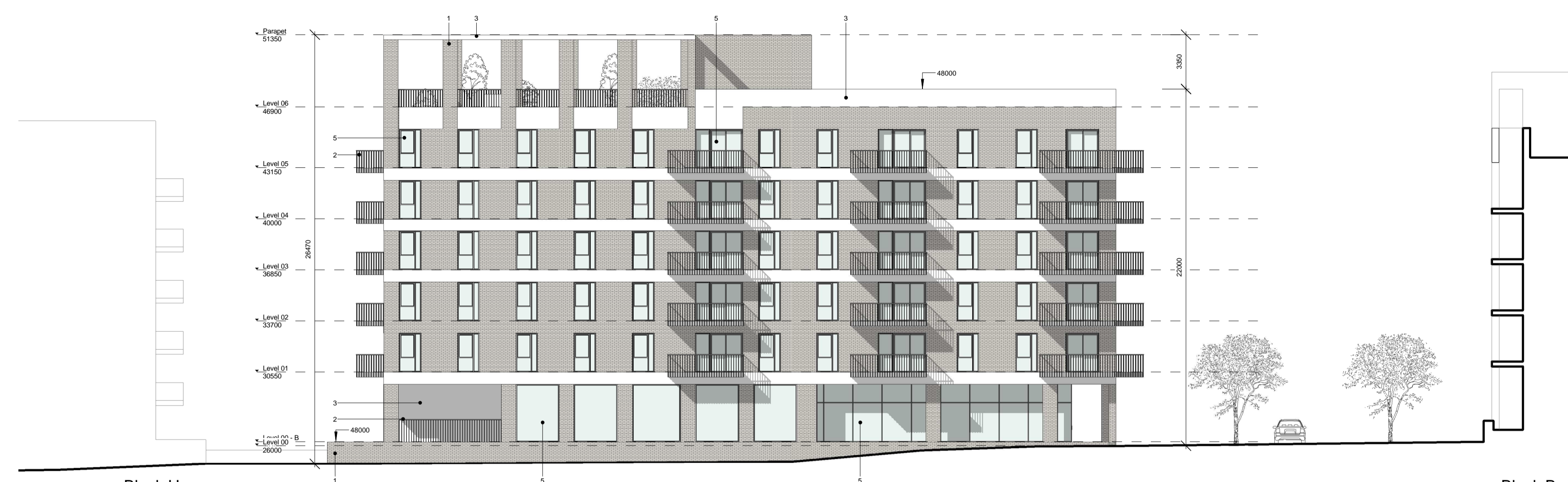
Block H 2 Block F - Elevation East 1 : 200